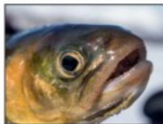
The face of the fish called Rödning.

was catching so he answered with a name that the king heard as 'Roding'. Since then the village has been called Roding.