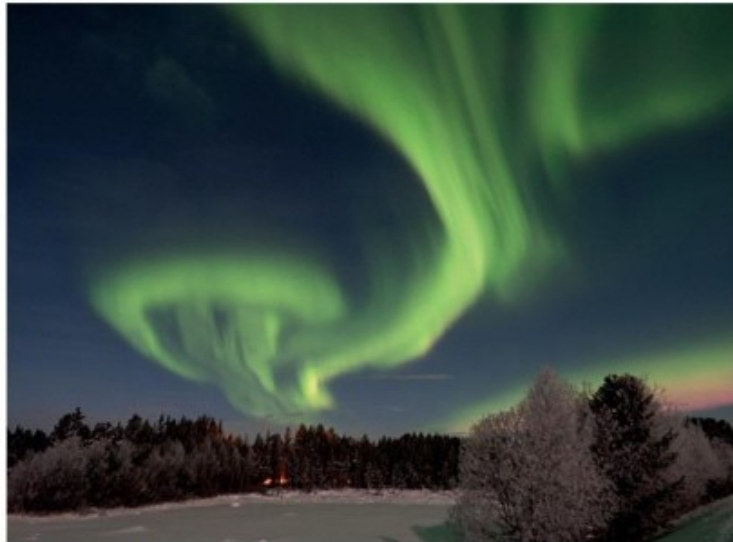
The Northern Lights are incredible to experience but not so easy to photograph.

Prepare before you go out! Dress warmly and carry a small light, for this