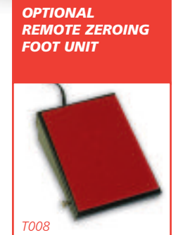
RZU is available for the Terratrip 1. This item can also be used on the Terratrip 202 Plus and Terratrip 303 Plus models